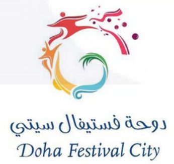
DOHA FESTIVAL CITY